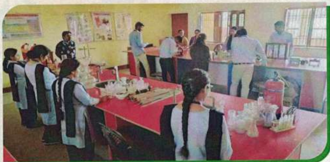
A view of the Science Lab

The College owns a magnificent library, equipped with a large numbers of books, journals and periodicals covering various fields of education. It has a very spacious and well-furnished & pleasant accommodation for the use of the readers.