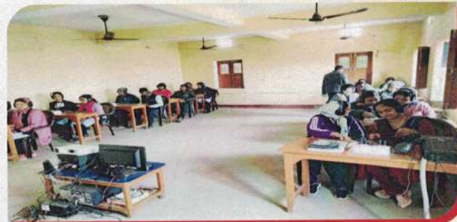
A View of the Language Lab

(*Pupil Teachers performing practical work in their ICT Lab). In the recent years, the emergence of computer technology has gained vital importance specially in the field of education with an eye to meet the day-to-day challenges facing the ever-changing world today. Owing to this, the college owns, a well established computer-lab with the interest of Broad-Band Facilities along with all necessary provisions.