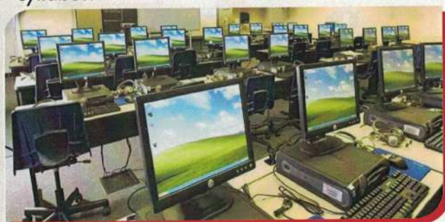
A View of the ICT Lab

(*Pupil Teachers performing practical work in their psychology lab). Laboratory of the college is equipped with all the required apparatus along with other accessories in the syllabus.