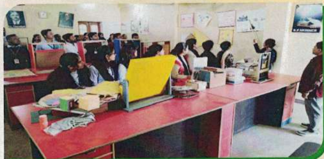
A view of the Psychology Lab

(*Pupil Teachers performing practical work in their Science Lab.) Science Laboratory of the college is equipped with all the required apparatus along with other accessories in the syllabus.