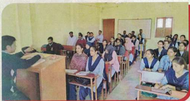
A View of the College Class Room