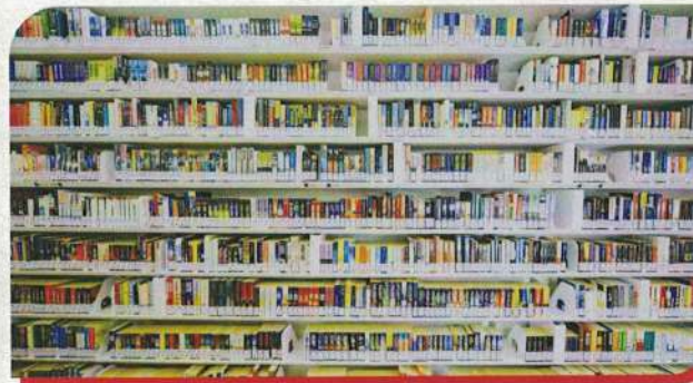
A View of the College Library & Reading Room

"The highest education is that which does not merely give us information but makes our life in harmony with all existence."